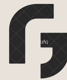
Ginyard Exclusive Residence